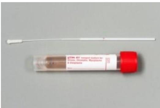
Figure 1: Flocked swab with UTM