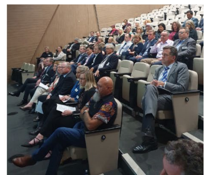
PathWest Strategic Plan Launch 11 October 2021